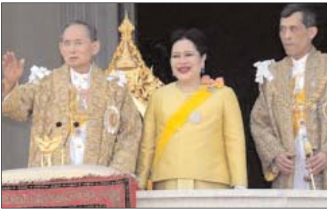
HAPPY BIRTHDAY —King Bhumibol (left), Queen Sirikit and Crown Prince Maja Vajiralongkorn of Thailand greet their subjects in this official photo.

Donations to Legacy are tax-deductible in the United States and can be sent to Legacy Institute, P.O. Box 7, Dundee, Ohio 44624, U.S.A.