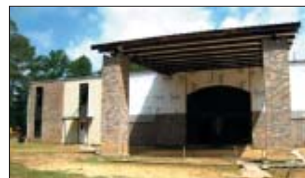
The UCG's new building in Big Sandy

"The site's goal is to reach one million actual visitors in 2008," he said.